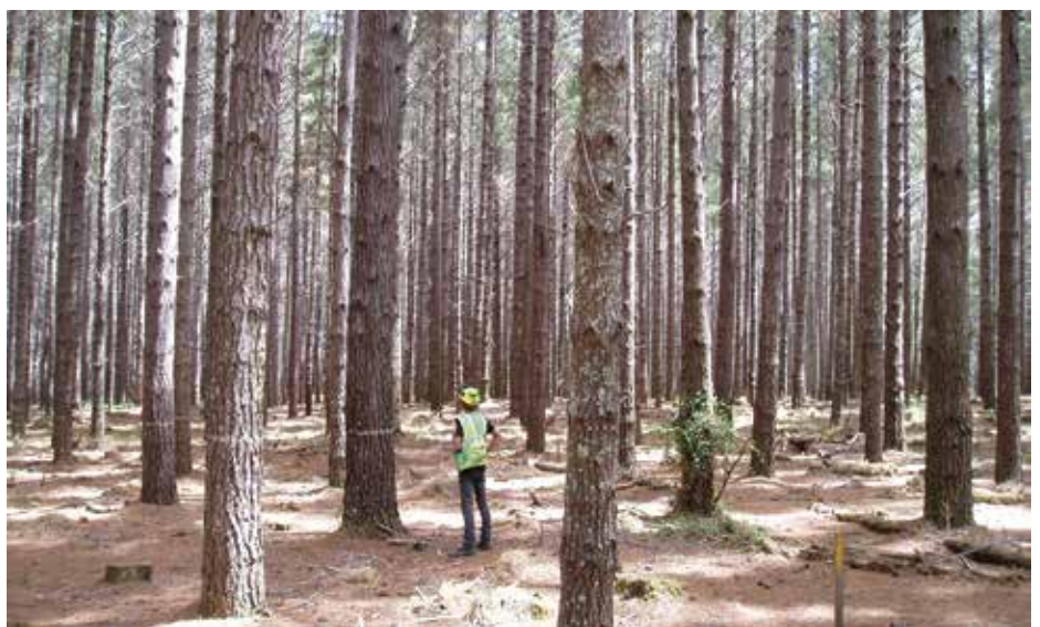
Woodhill forest long-term trial site, 2014.