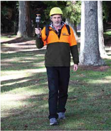
Handheld mobile laser scanner ZEB1.