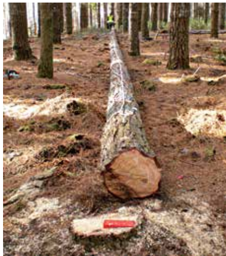
Preparation for biomass measurements.

The research team has been busy in the field sampling the LTSP trials to determine if planted radiata pine forests in New Zealand can be sustainably managed into the future. They recently completed the end of rotation sampling of the Woodhill long-term trial and have now started sampling the Tarawera long-term trial. These trials are part of a larger trial series specifically installed about 30 years ago to test the impacts of harvest removals and fertilisation on site productivity. Rotation-age data from the LTSP trials coming up for harvest (Woodhill, Tarawera and Berwick) will allow the programme to build on earlier trial findings, advancing global knowledge on the sustainability of growing successive rotations.