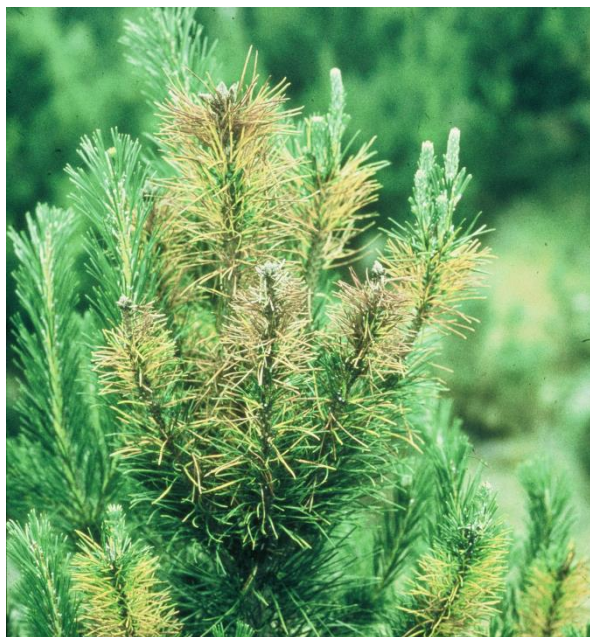
Figure 1. Boron deficiency symptoms in Pinus radiata .

Since the initial work that described the occurrence and correction of B deficiency in New Zealand (Will et al. , 1963, Will, 1985), a number of B fertiliser trials have been undertaken in different parts of the country to determine if deficiency is present, appropriate application rates, and to examine interactions between B fertilisation and management practices. We have reviewed these studies with the aim of improving our understanding of stem growth responses to B fertilisation.